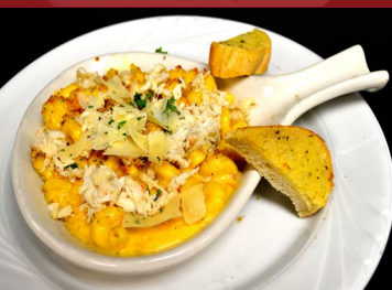
Crab Mac' & Chees