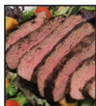
Steak Tenderloin 9