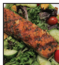
Atlantic Salmon 10.5