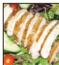
Chicken Breast 6

Top your Salad with Grilled or Blackened . . .