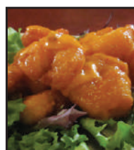
Boom Boom Shrimp 9