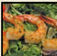
Sautéed Shrimp 7