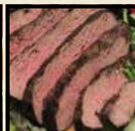
Steak Tenderloin 8