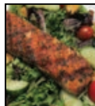
Atlantic Salmon 13.99