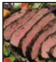
Steak Tenderloin 10.99