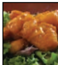
Boom Boom Shrimp 9.99